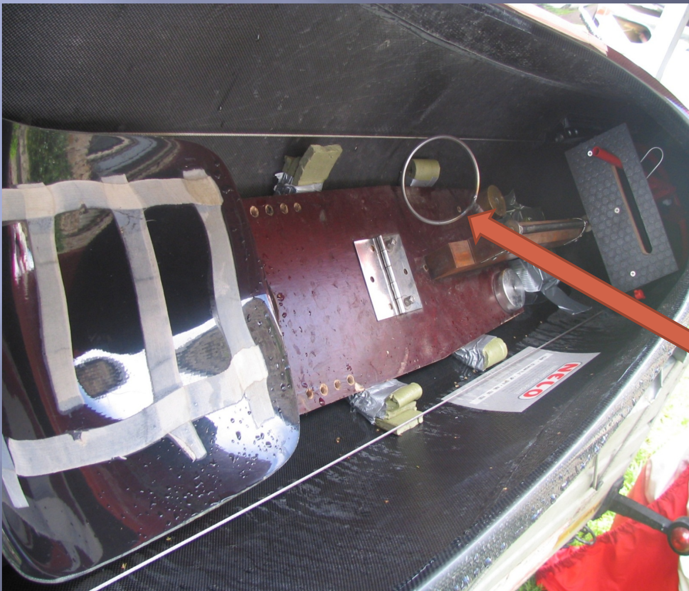
The rudder adapted for leg amputees